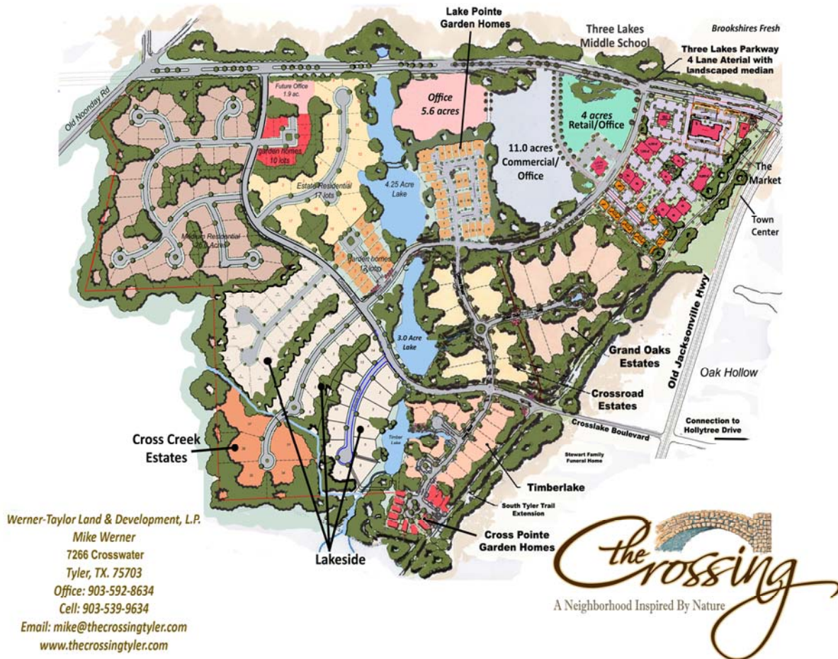
Figure 1 - Overall Master Plan

The Crossing is designed to optimize suburban needs by strategically intermingling small neighborhood retail centers with regional retailers and entertainment uses along Three Lakes Parkway with the residential developments within the interior of the property. Office uses are to be generally concentrated near the retail centers and alongside water features which will be seen throughout the development. The goal of this development is to successfully integrate a variety of land uses and densities to accommodate all the needs of the patrons and homeowners.